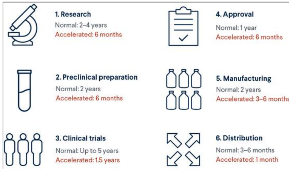
Figure 1. Overview: Normal vs. Accelerated Vaccine Development Process